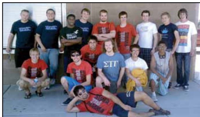
Brothers of the Epsilon Zeta Chapter take a break from volunteer work.

Brothers of the Epsilon Zeta Chapter volunteered at the Northern Arizona Special Olympics Area Games, a large scale event where athletes participated in running, javelin throw, shot put, and other events. An impressive 95 percent of Epsilon Zeta Chapter helped set up the arena, support the athletes, keep time and scores, and afterward, doing clean up. They also volunteered at the Wounded Warrior 5k run.