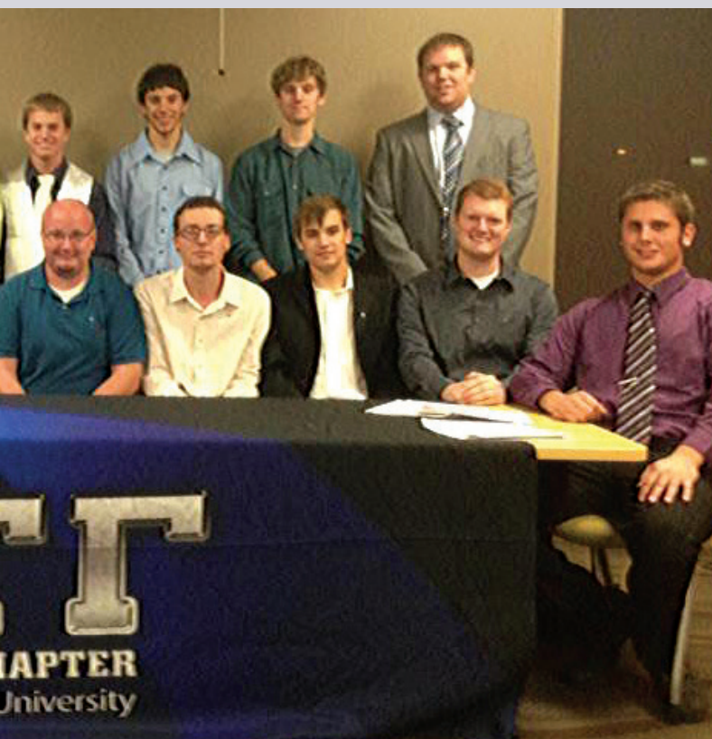
The Beta Xi Chapter