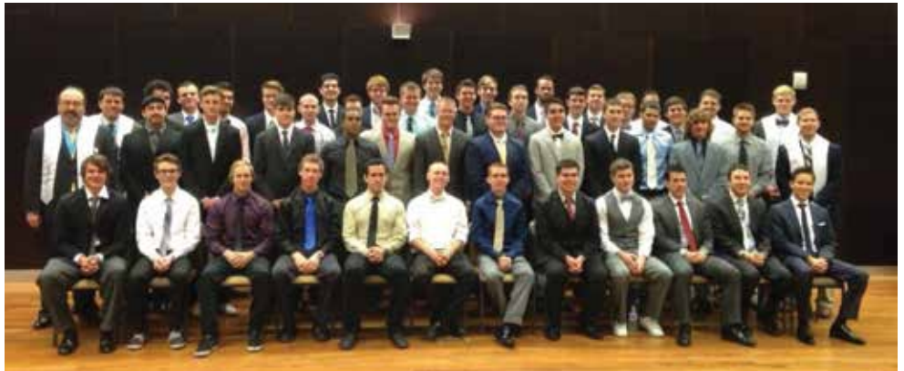
Arizona State University Provisional Chapter

Sigma Tau Gamma conducted the Ceremony of Installation at Arizona State University on March 2, 2014. The Arizona State University provisional chapter welcomed family, friends, students and university administrators to watch the ceremony. This is the first time Sigma Tau Gamma has had a provisional chapter at Arizona State University.