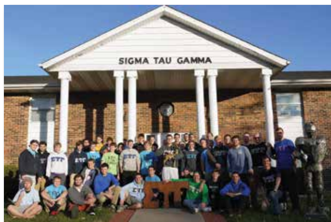
Beta Chapter, Truman State University

In addition, at a formal campus banquet, the Beta Chapter won the following awards: Most Improved GPA (increased .54), Excellence in Risk Management, Best IFC Service and Philanthropy Chapter, Outstanding Organization for Service (a campus-wide award), and for the first time in almost 10 years, the Chapter of the Year Award for Greek Life. The brothers also won first place in Greek Week, the Greek Pillar Award for Leadership, and Best Philanthropy for raising almost $1,000 for Victim Support Services.