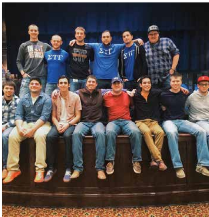
Above, Tau Chapter, East Central University

Members of Tau Chapter worked with their local Special Olympics team, McCall's Chapel in Ada, Oklahoma this year. They practiced flag football and got ready to compete with them as unified partners for the state championship in Oklahoma. They did a benefit concert for Special Olympics and raised over $1,000.