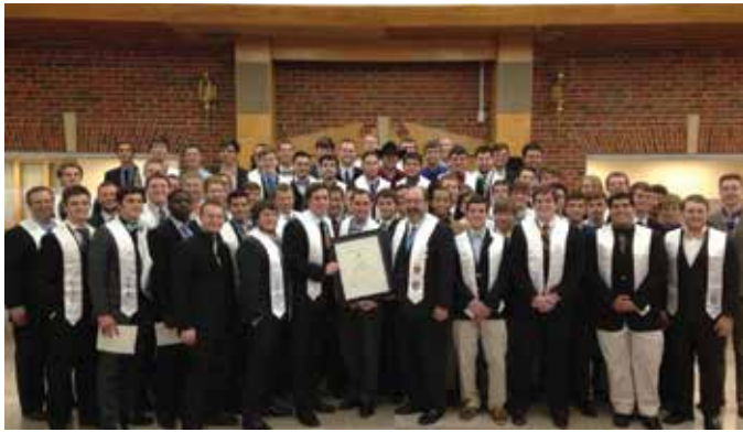
Epsilon Psi Chapter

As a provisional chapter, the men have attended all national meetings to build brotherhood with current alumni brothers from all over the