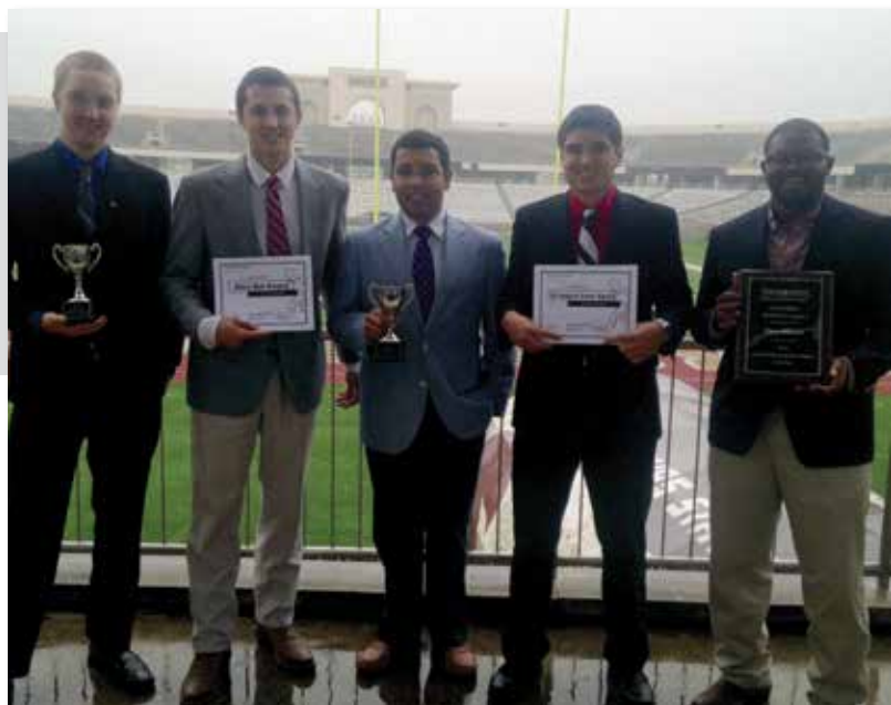
Above, Delta Epsilon brothers with their Greek Week awards