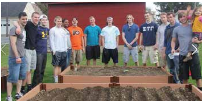
Gamma Tau community service

In April, members of the Gamma Tau chapter helped plant shrubs around campus to help out the Millersville University Center for Sustainability for community service.