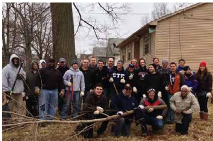
Above, Beta Gamma brothers volunteering at work day

As part of initiation weekend, the brothers and associate members of Beta Gamma Chapter spent the morning volunteering at a work day put on by their local charitable partner, the Youngstown Neighborhood Development Corporation (YNDC), a nonprofit organization with the mission of revitalizing the city of Youngstown, Ohio. Beta Gamma brothers and associates worked with the community to clean and landscape nine blighted properties in a neighborhood on Youngstown's south side.