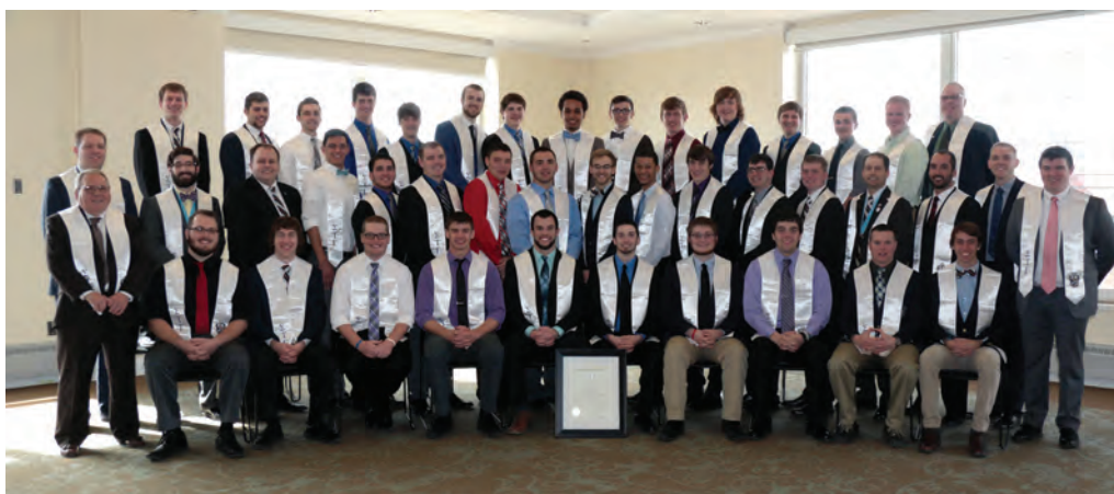
Northwest Missouri State Re-Chartering Ceremony

Theta Chapter at Northwest Missouri State University in Maryville, MO held their re-chartering ceremony on Sunday, March 15, in the J. W. Jones Student Union. Theta chapter has 33 active brothers. More than 90 people attended the dinner and ceremony. Honored guests included Theta chapter alumni, national officers, dates of the members and more than two-dozen parents and family members. The active brothers participated in a chapter retreat on Saturday, prior to the ceremony.