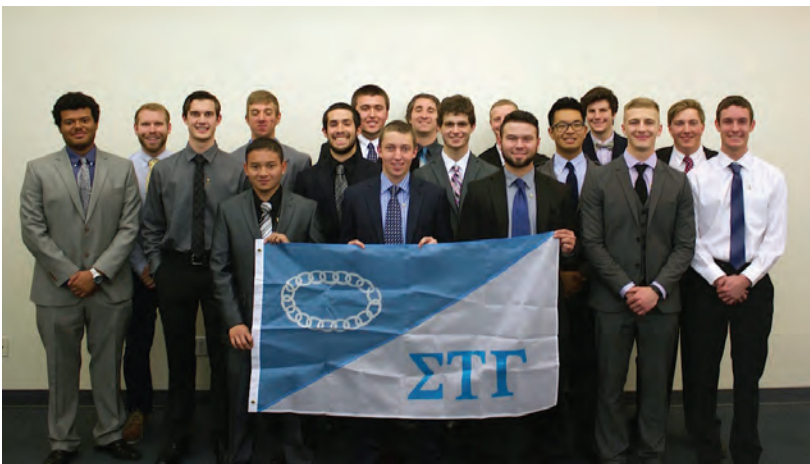
Reno Provisional Chapter Installation