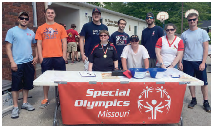
Alpha Phi brothers at the Special Olympics philanthropy

In April, brothers from the Alpha Phi Chapter participated in a local free throw contest for their local Special Olympics branch. The Chapter also donated $50 to Special Olympics.