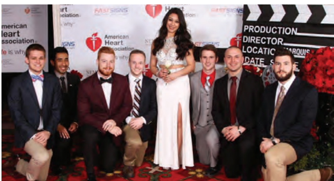
Beta Iota brothers at the American Heart Association Heart Ball

Brothers from the Beta Iota Chapter, along with the chapter's 2014 White Rose Sweetheart, attended the American Heart Association Heart Ball.