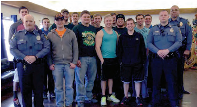
Alpha Omega brothers volunteering at the 2015 Special Olympics of Missouri Torch Run

Brothers from the Alpha Omega Chapter worked with the Missouri S&T Police to support the 2015 Special Olympics of Missouri Torch Run.