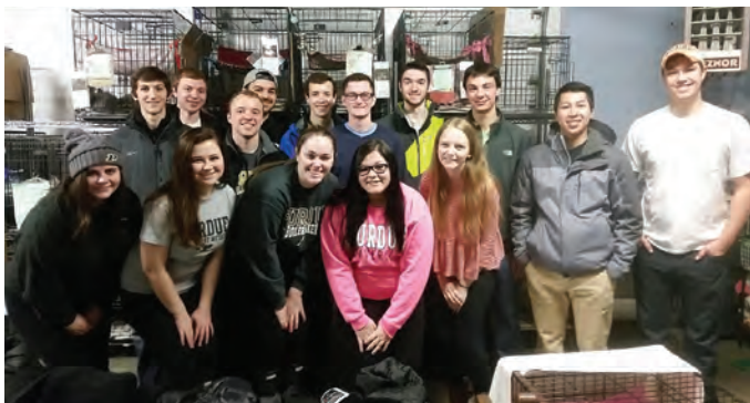
Beta Theta brothers volunteering at the Almost Home Humane Society

On March 1, Beta Theta Chapter teamed up with Gamma Phi Beta to volunteer at the Almost Home Humane Society in Lafayette, IN. Members washed cages, refilled food and water, moved furniture, and gave all the dogs and cats some exercise outside.