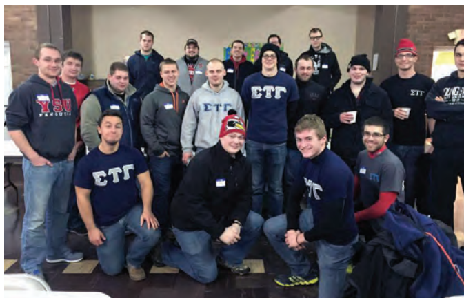
Beta Gamma brothers volunteering at the Wick Park Easter Egg Hunt