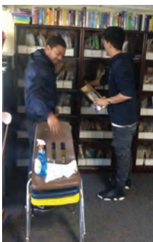
Sigma Tau Gamma brothers at the Association of Fraternal Leadership and Values Annual Conference (AFLV) in Indianapolis, IN.

The men came together during the affiliation lunch and discussed how to take what they had learned back to their chapters and campuses.