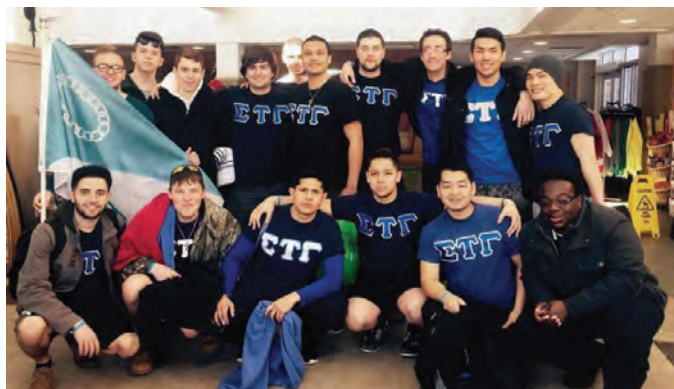
Beta Upsilon brothers at the Polar Plunge

In February, 15 brothers from the Beta Upsilon Chapter participated in the Polar Plunge in Geneva, OH. Members raised $2,300 to support the Special Olympics.