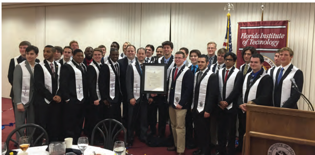
Florida Tech. Chartering Ceremony

The chartering ceremony was held at the Denius Student Center on the Florida Tech. campus in Melbourne, Florida.